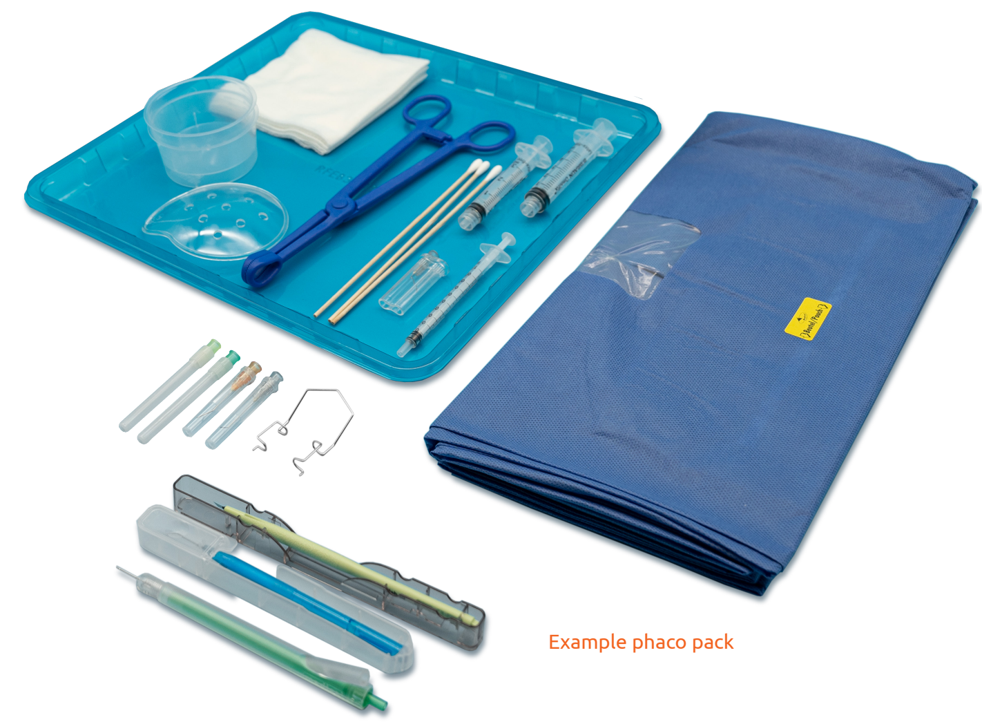
Example phaco pack